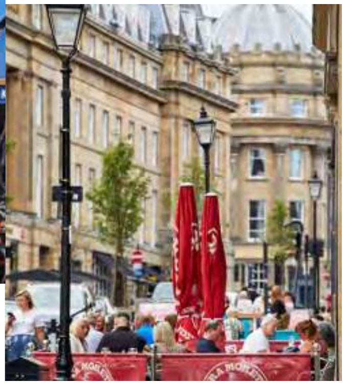
Central Arcade is situated in a prime retail and leisure pitch between Grainger Street and Grey close to Blakett Street and the Eldon Sq Street Shopping Centre.