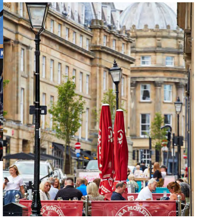
Central Arcade is situated in a prime retail and leisure pitch between Grainger Street and Grey close to Blackett Street and the Eldon Sq Street Shopping Centre.